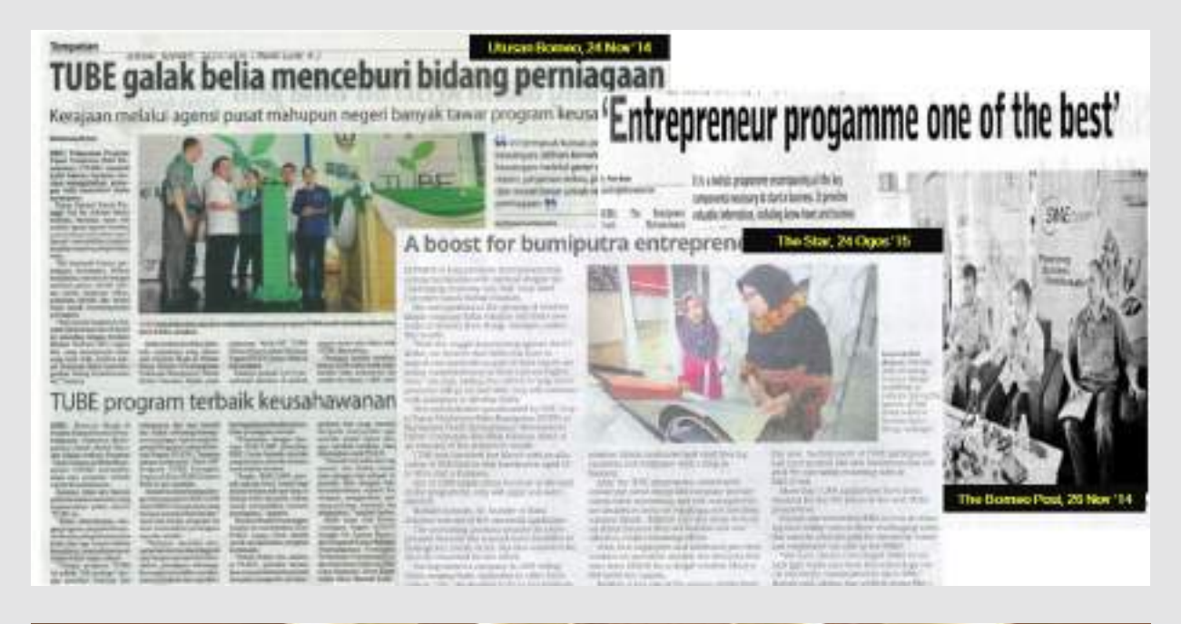
Illustration 2: Strengthening Entrepreneurship through TUBE Programme

TUBE aims to foster the entrepreneurial spirit among youths, enabling a paradigm shift from being a job seeker to becoming a business owner; and establishing resilience among youths in managing their own businesses. (refer Illustration 2).